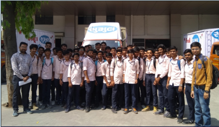
Branch : Mechanical Engineering ( 4th Semester) Industry : Sumul Dairy, Surat Date : 18-03-2019