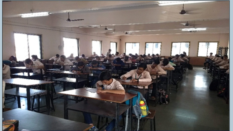
Essay Competition was arranged on 13-02-2019 On the Occasion of 150th Birth Anniversary of Mahatma Gandhi