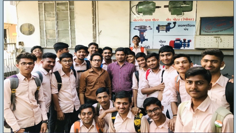
Branch : Electrical Engineering ( 4th Semester ) Industry : Tripple D motors, Surat Date : 28-02-2019