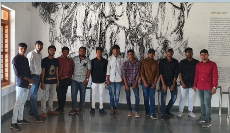
Visit of National Salt Satyagraha Memorial, Dandi on 13-03-2019 under Gandhi Vichar Kendra