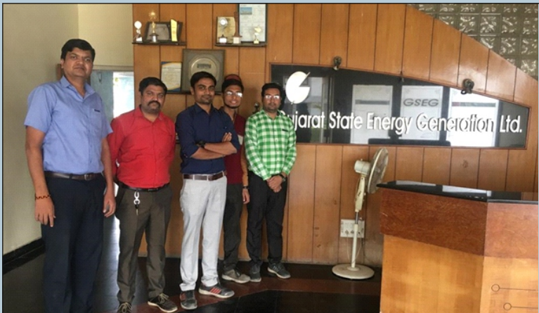
Branch : Mechanical Engineering Industry : Gujarat State Energy Generation Ltd, Hazira Date : 02-02-2019