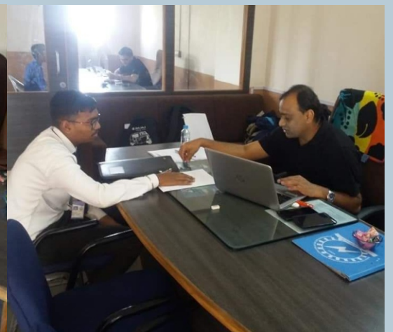
Personal Interview of Bajaj Auto Ltd, Pune on 15-02-2019