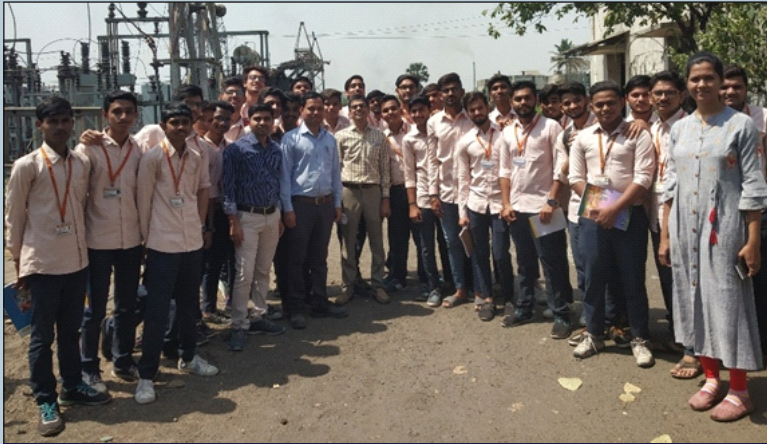
Branch : Electrical Engineering ( 6th Semester ) Industry : 132 kV Bhestan Substation ,Pandesara, Surat Date : 13-03-2019