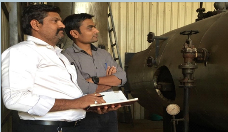
Branch : Mechanical Engineering Industry : Virat Threads, Palsana Date : 02-02-2019