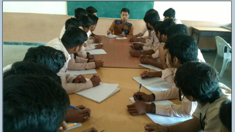
Meeting of Batch faculty with 4th semester students of Mechanical Engineering Department on 19-03-2019