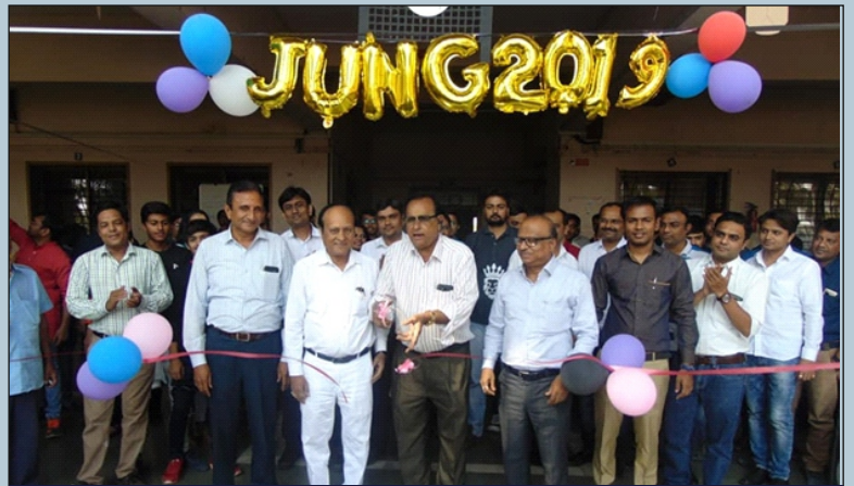
JUNG-2019 (Sports) organized on 7th & 8th February 2019