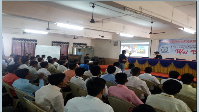
Preplacement talk of Bajaj Auto Ltd, Pune on 15-02-2019 for final year Mechanical and Automobile Engg Students