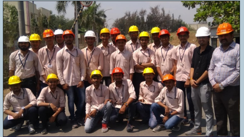
Branch : Mechanical Engineering (6th Semester) Industry : Gujarat State Energy Generation Ltd, Hazira Date : 16-03-2019