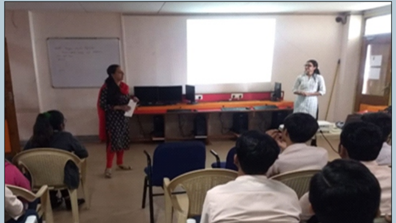
Branch : Computer Engineering ( 6th Semester ) Topic : "JAVA" Name Of Expert : Prakshal IT academy, Surat Date : 12-02-2019