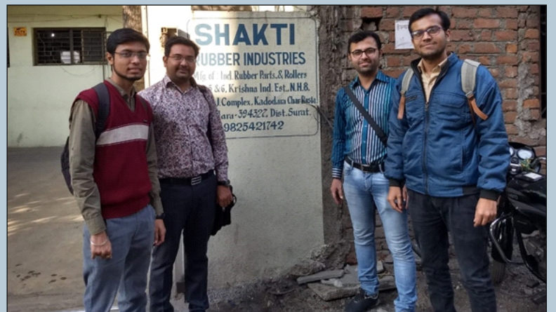
Branch : Mechanical Engineering Industry : Shakti Rubber Industries, Surat Date : 02-02-2019