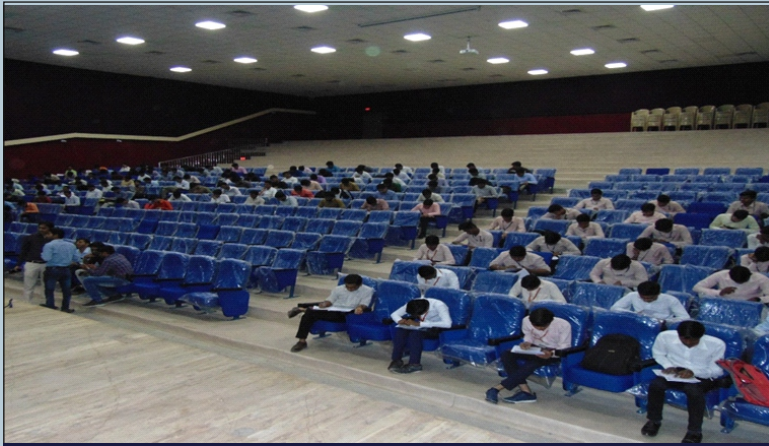
Written test for placement by MRF Ltd., Dahej on 28-02-2019