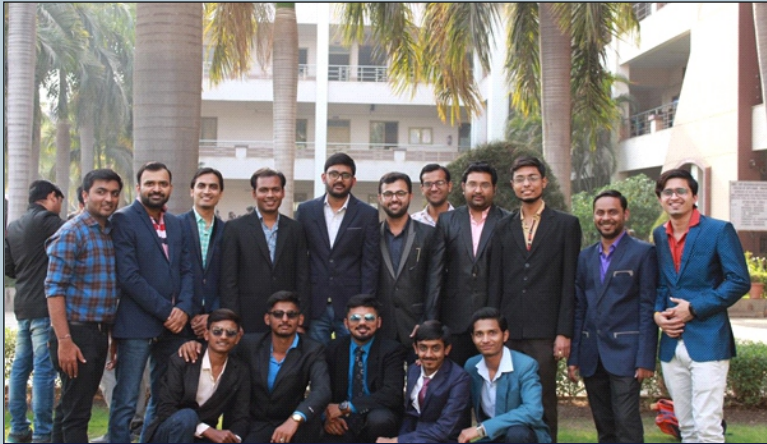
Celebration of Suit and Saree Day on 05-02-2019