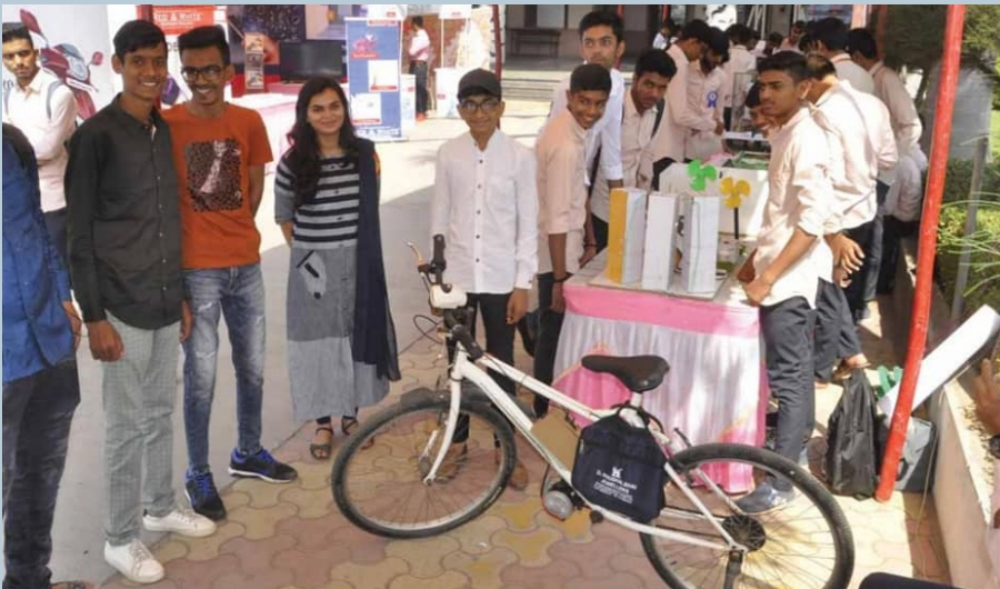
Gyanotsav 2019 (Technical Events) organized on 7th March 2019