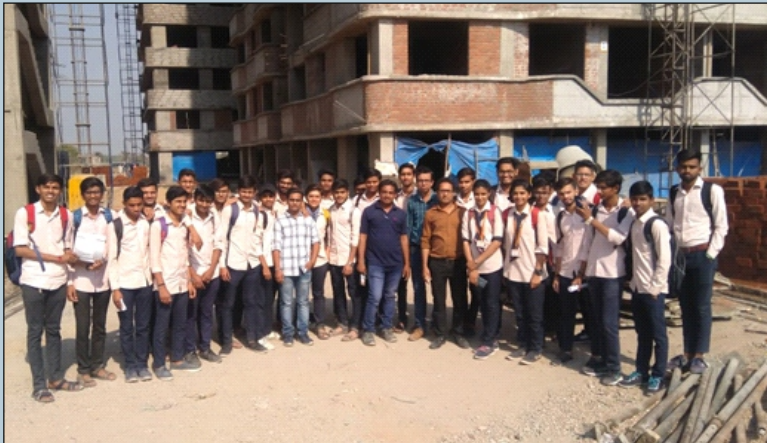
Branch : Electrical Engineering ( 6th Semester ) Industry : High rise building, Surat Date : 20-02-2019