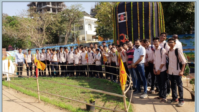
Visit of Dwadash Jyotirlinga Divyadarshan Fair by 2nd semester students of Mechanical Dept at Kranti Medan, Surat on 02-02-2019