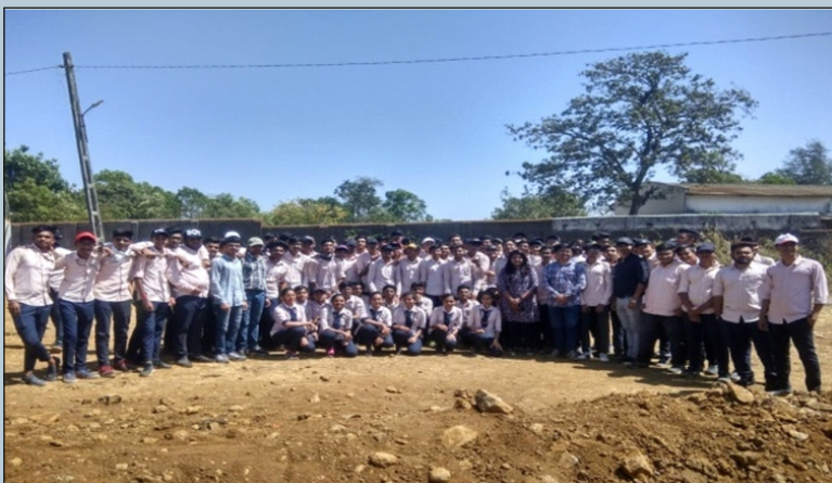
Branch : Civil Engineering ( 4th Semester ) Industry : Saputara Hilly Area Date : 18-03-2019