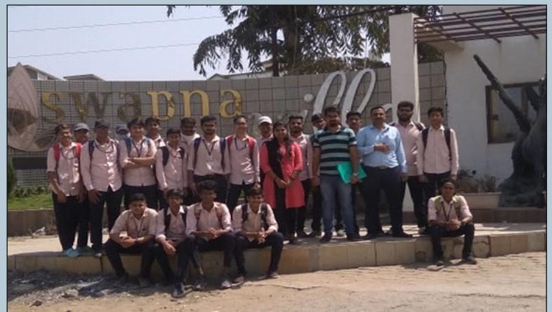
Branch : Civil Engineering ( 2nd Semester ) Industry : Swapnavilla Bunglows, Surat Date : 30-03-2019