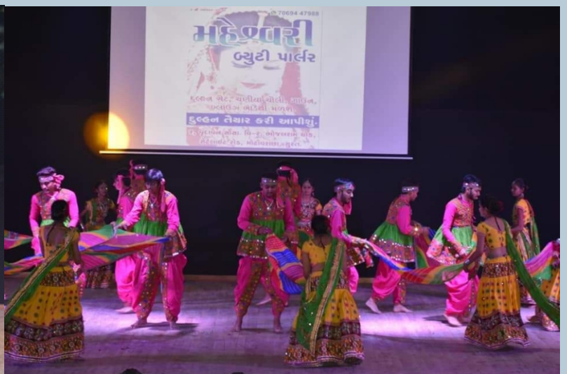
Harmony 2019 (Cultural Events) organized on 8th March 2019