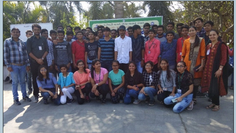
Branch : Computer Engineering ( 4th & 6th Semester ) Industry : Balaji Waffers, Valsad Date : 19-01-2019