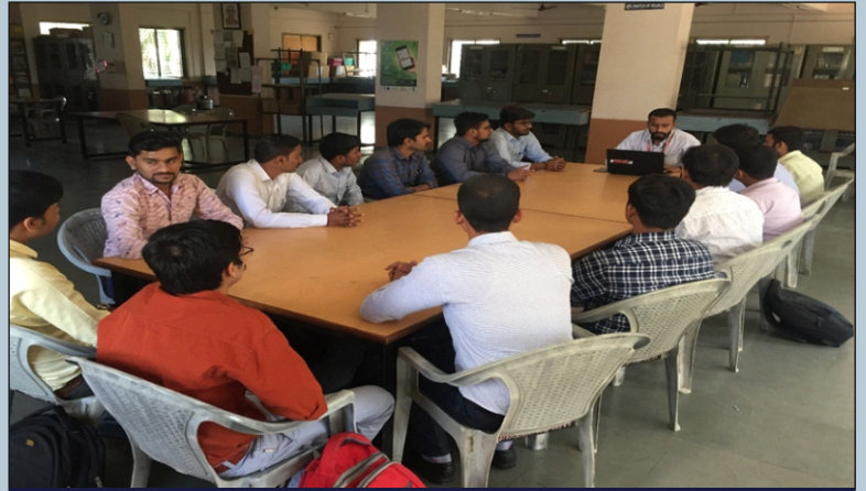
Group Discussion for placement by MRF Ltd., Dahej on 28-02-2019