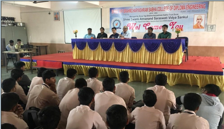
Meeting of CR & CO with principal sir on 04-02-2019