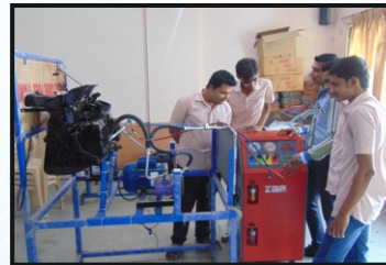
Vehicle air conditioning Lab