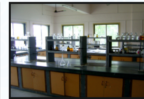
Water Supply & Sanitary Engg.Lab