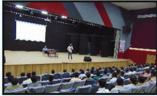
Pre-placement talk by MRF Tyres, Dahej on 28/02/2019