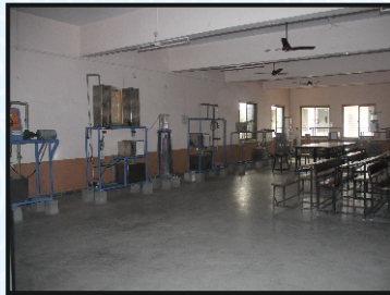
Fluid Mechanics Lab