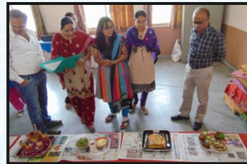
Instant Cooking & Sald Decoration Competition