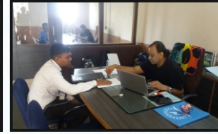
Personal Interview by Bajaj Auto Ltd., Pune on 15/02/2019