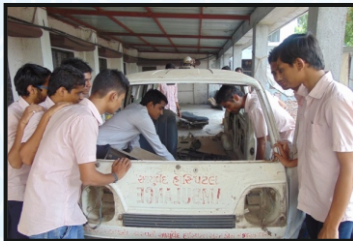
Automobile Garage Lab

Mission : To provide innovative, unique and quality professionals in the field of technical education that delivers superior measurable values, needs and demand of the society by providing right ambience, environment and continuous learning-teaching methodology.