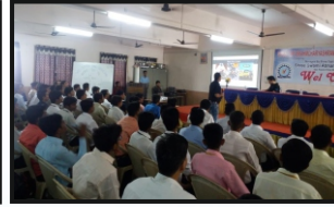
Pre-placement Talk by Bajaj Auto Ltd., Pune on 15/02/2019