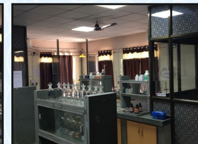
Environment Audit cell