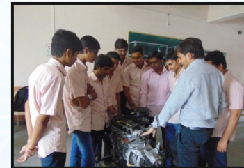
Automobile Engine Lab