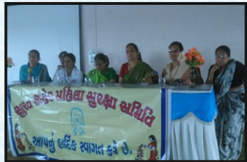
Awareness on 181 Mahila helpline