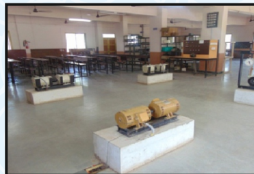
DC Machines & Transformers Lab

Mission : To impart quality and value based technical education enabling the students to meet the growing challenges in the field.