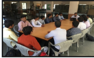
Group Discussion held by MRF Tyres, Dahej on 28/02/2019