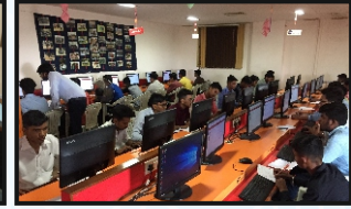
Online Screening Test by Joha Deere Equipments Pvt. Ltd. Pune on 01/04/2019