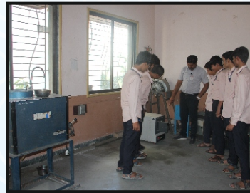
Material Science Lab