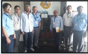
Industry Visit by Trustee Members, Principal & TPO at Brakes India Pvt. Ltd., Jhagadia on 20/09/2018