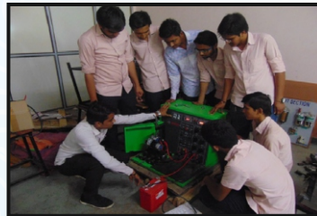
Automobile electrical system diagnosis & testing Lab