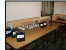
Basic Electrical Lab