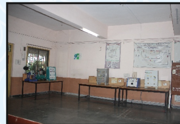
Switchgear & Protection Lab