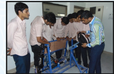
Automobile Transmission Lab