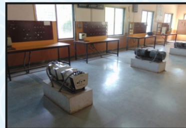
Polyphase Transformers & AC Machines Lab