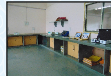
Power Electronics Lab