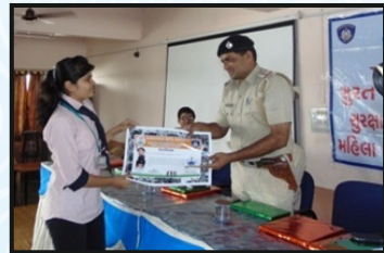
Self Defense Programme for Girls