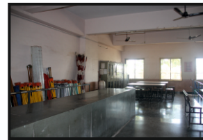
Surveying & Structural Mechanics Lab